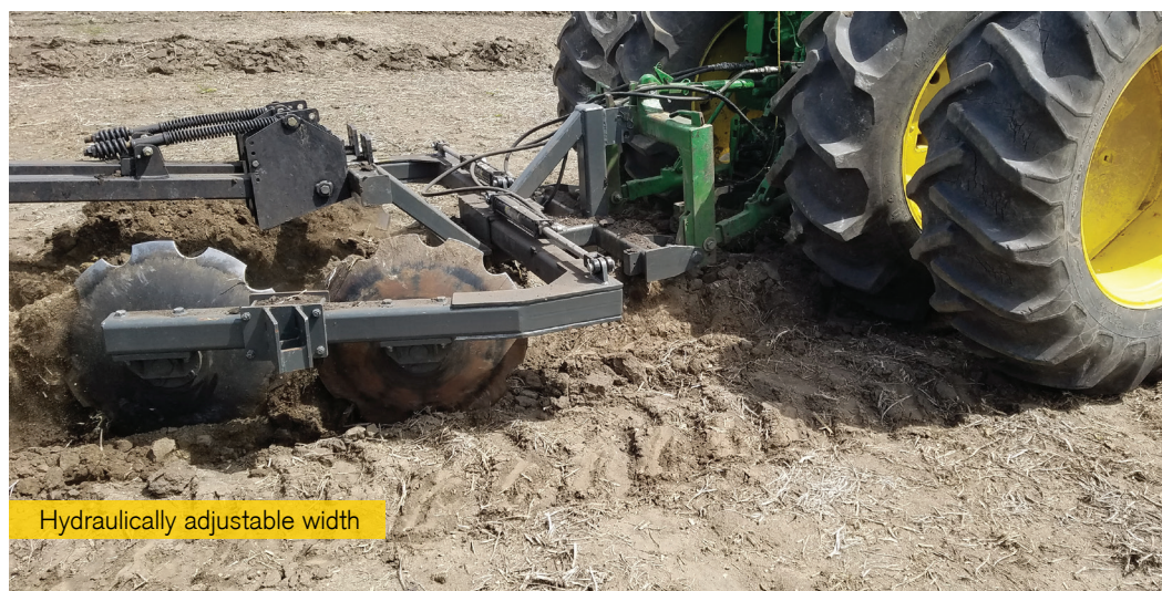
Hydraulically adjustable width

The Crary® TRENCH PRO's simple and effective design makes easy work of leveling and filling the tile trench left by a tile plow, and it's adjustable.