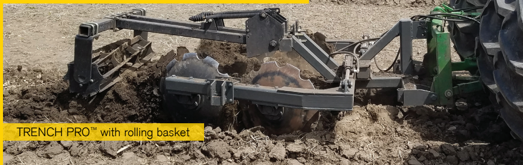
TRENCH PRO™ with rolling basket